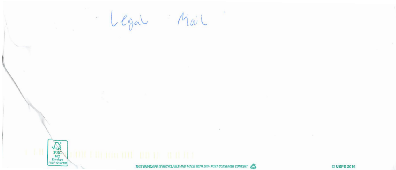
Government's Amended Sentencing Memo